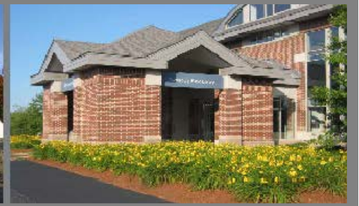
Library, Chandler and Main Streets