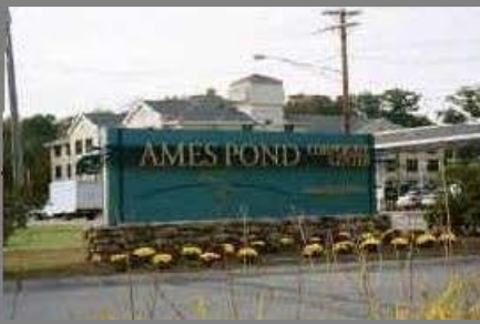
Andover Street, Rt. 133