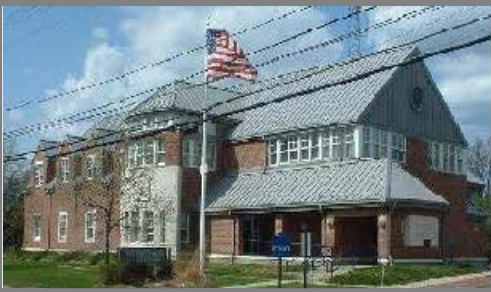
Police Station, Main Street, Rt.38