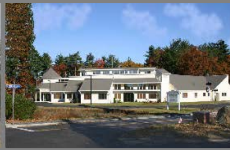
Senior Center, Chandler Street